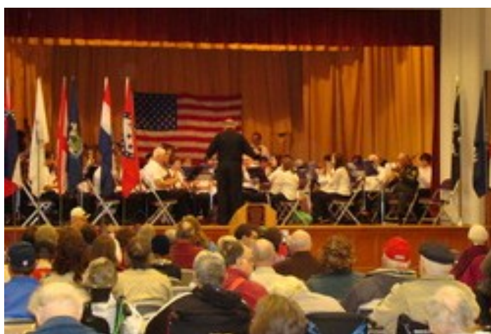
Puyallup Valley Community Band performs at the Washington Soldiers Home in November 2010.

Mark your calendar and come out on Friday, May 20 th at 7:30 pm for an outstanding concert by local musicians and support a great local cause at the same time! Donations of nonperishable food items will also be accepted at the evening concert.