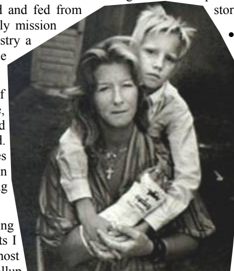
Homeless in America, photograph by Tipper Gore