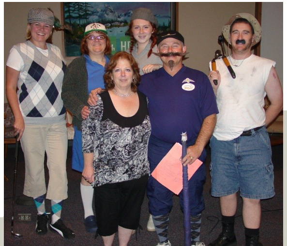
2010's Mystery Dinner featured a golf tourney gone bad!

On Halloween 100 years ago, as he was driven out of Reaper Junction, Emil vowed to get revenge on the mob and its progeny. The curse was all but forgotten by today's generation who laughed at such nonsense. But, last night, a local staggered into the town square and announced that Evil-Eyed Emil had been sighted in the woods, and true to his century-old proclamation, someone had been the victim of his anger.