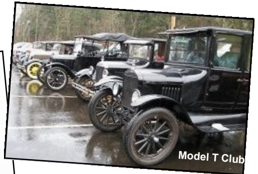
PVCNS has been at FCC since the 1980s