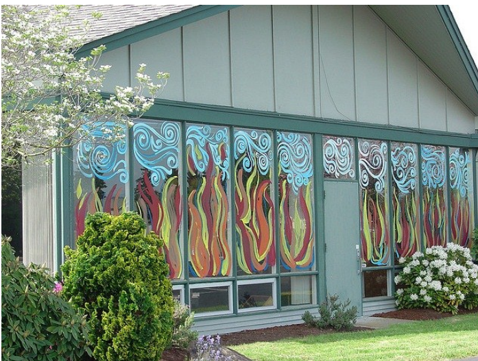
Sanctuary windows were painted with wind and flames to depict the Holy Spirit for Pentecost Sunday 2008

Since before the first of the year, an ad hoc group of church members has been hard at the task of gathering and evaluating bids from three general contractors to replace all the windows in the sanctuary, the parlor, and the church offices; and to repair damaged siding on and paint the church building, garage and Fair Parking shed. All this is in addition to the recent resurfacing of our parking lot! Why are we having all this work done now?