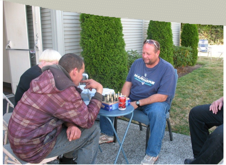
Summer 2010: The Hangout guests hang out in the shade with a chess board, a cool drink, and friends

First Christian Church offered the use of two classrooms and other churches joined in to help staff, donate supplies, and provide food, transportation, and other resources. The drop-in center was named The Hangout , and the number of guests ranged from 7 to 23 each afternoon. The ministry was well received by both guests and volunteers—six participant churches were represented by volunteers at a recent planning meeting for the 2011 season!