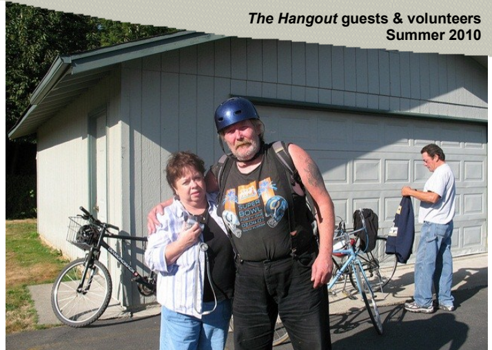
The Hangout guests & volunteers Summer 2010

As a congregation we have an obligation not only to our forbearers to maintain the facilities they built, but also to the generations that will follow us who will continue to use the facilities to do God's work here in Puyallup. Our Guiding Vision declares that we "are called by God to live as a blessing in our own neighborhoods and in the world." Our mission is not just to maintain the church buildings for our own private use, but rather our mission is to maintain the facilities so they may be used as a resource, a tool, for doing the ministries that enable us to be a blessing in our own neighborhoods and the world. To that end, God has blessed us with ample resources to do all the work that is underway.