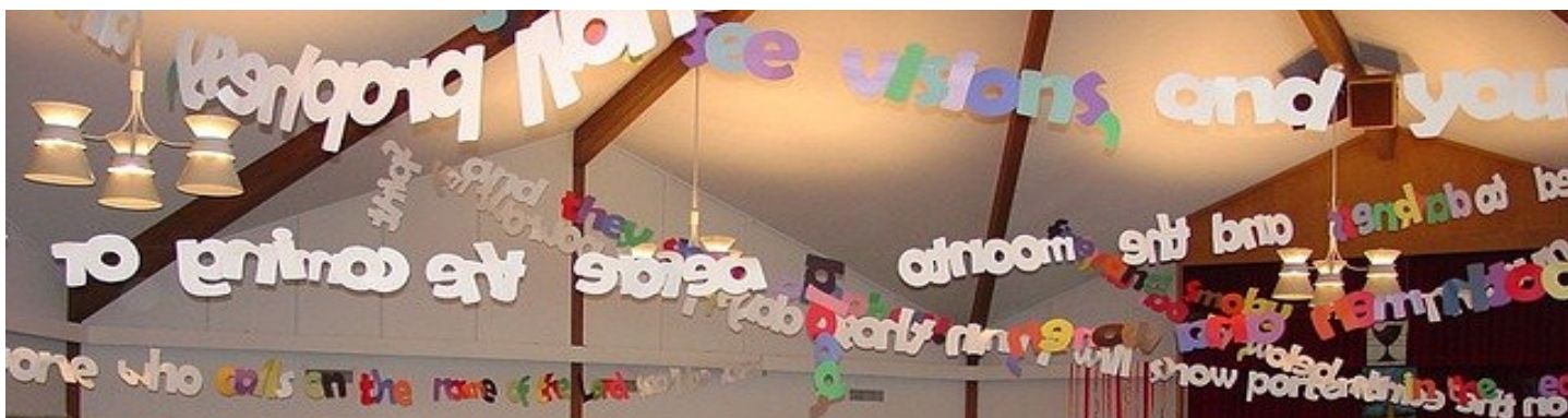
FCC Sanctuary, Pentecost Sunday 2005

WEAR RED ON SUNDAY, JUNE 12TH TO WELCOME THE HOLY SPIRIT INTO WORSHIP!