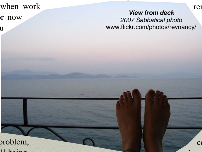
View from deck 2007 Sabbatical photo

During our summer worship we will come together as a community of faith to engage in the spiritual practice of Sabbath keeping. We will study the roots of the Sabbath traditions, explore ways to honor the Sabbath, encourage one another to accept the gift of Sabbath, and join in celebration of the God who gives us rest.