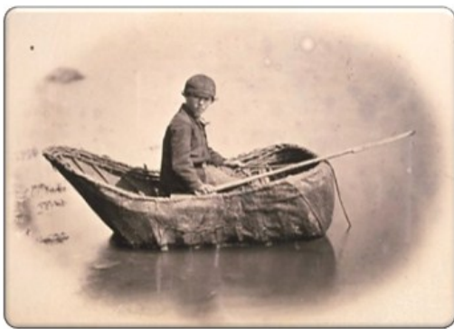
Boy sits in a traditional Welsh coracle, 1865

Celtic pilgrims often went to sea in tiny boats, coracles, sailing forth without a rudder. They trusted that God would guide them to their “place of resurrection.” They believed that amid the winds and waves, there was a guiding force luring them toward holiness and wholeness. This is our hope too, as we journey on our own uncharted paths, often with nothing more than prayer to guide us.